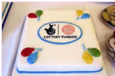
One of three cakes kindly donated by the Warkup family

With the speeches concluded the Humberside Police Band continued to play wonderful music as voices of approval and wonder buzzed around the room. The committee served up a wonderful buffet and dispensed numerous cups of tea and coffee. Skipsea Village Hall had come alive.