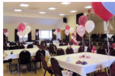
The Windsor room ready for the party to begin

There will be a series of special events in the new Village Hall this winter, many of which are partly funded by Awards For All. We are lucky that three professional theatre productions are coming to Skipsea in Dec. & Jan. Skipsea residents will have priority – tickets will go on sale at Skipsea Post Office about a week before they go on general release. (* Keep an eye open for details in PO window.) In addition, Skipsea residents will be able to buy cut-price tickets by cutting out the relevant token which appears on this page, taking it to Skipsea PO to get £2.50 off any ticket bought for themselves or any member of the family, who must also be a Skipsea resident. [The Awards for All funding is specifically for Skipsea Village.]