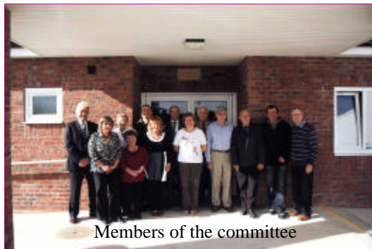
Members of the committee